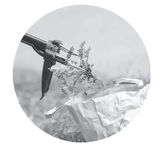
4. fertiliser / snails 5. earthworms / weeds 6. snails / caterpillars