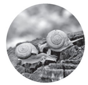
3. caterpillars / snails