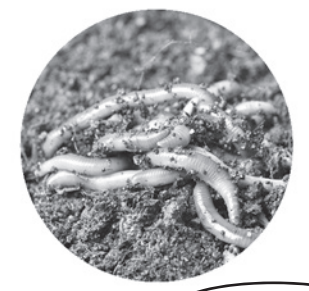
1. caterpillars / earthworms